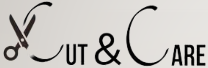
Initial Logo in Prototype